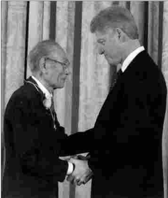
KOREMATSU RECEIVES THE MEDAL OF FREEDOM

Sixty-seven years later, the San Leandro School Board is taking nominations for the naming of a new school, the new 9th grade campus at San Leandro High School. Many persons in San Leandro, including myself, believe the school