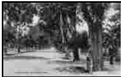
HISTORIC ESTUDILLO AVENUE