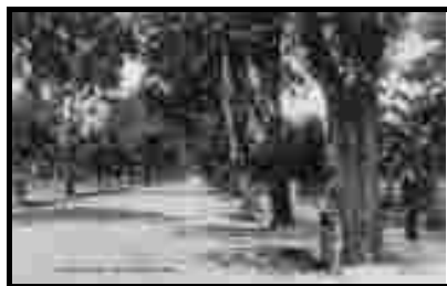
HISTORIC ESTUDILLO AVENUE

Have you noticed there is a great restoration going on in our town? It is the Bal Theater, and includes the restoration of the marquee, new paint, replacement of the neon, and the installation of a new reader board and three sets of